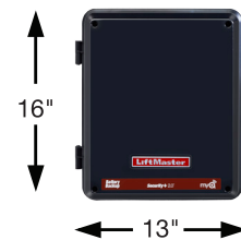
LA412CONTDC Standard Control Box