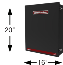
XLSOLARCONTDC Extra Large Control Box

* Basic set up with remotes programmed. Does not include added accessory power draw. LiftMaster low power draw accessories recommended to extend cycles and standby time on battery backup.